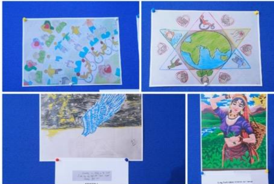
Art Submission by PwMS for WMSD