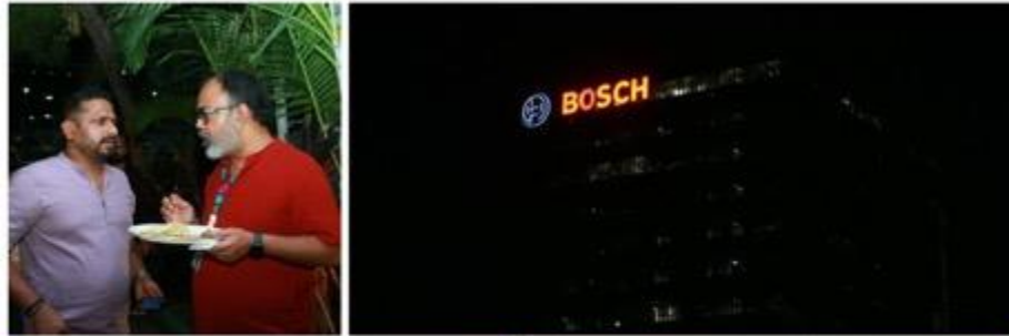
Active support from Bosch during WMSD Celebration